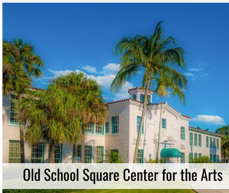
Old School Square Center for the Arts

The Old School Square Crest Theater, located in Delray Beach, is a performing arts center housed in a restored 1925 high school, and incorporates exhibition galleries and indoor/outdoor community spaces. Bildworx Design performed MEP engineering design services for interior renovations to multiple areas within the theater.