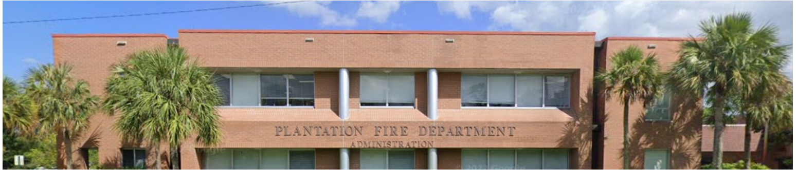
City of Plantation Fire Station 2