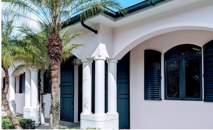
Three Flamingos Equestrian Property

The Three Flamingos is a $13M private property of 27,224 sq. ft. located in the equestrian capital of Wellington, FL. Mixed-occupancy buildings within the property required complete interior renovations. Bildworx Design performed MEP engineering design services to office, residential, and horse stable areas.