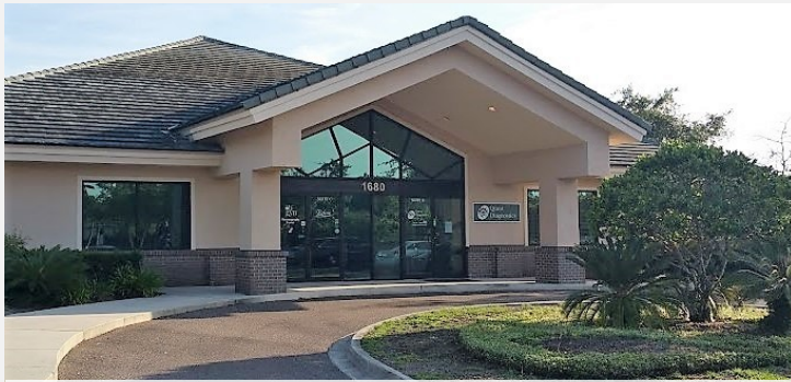
Quest Diagnostics - Multiple Locations