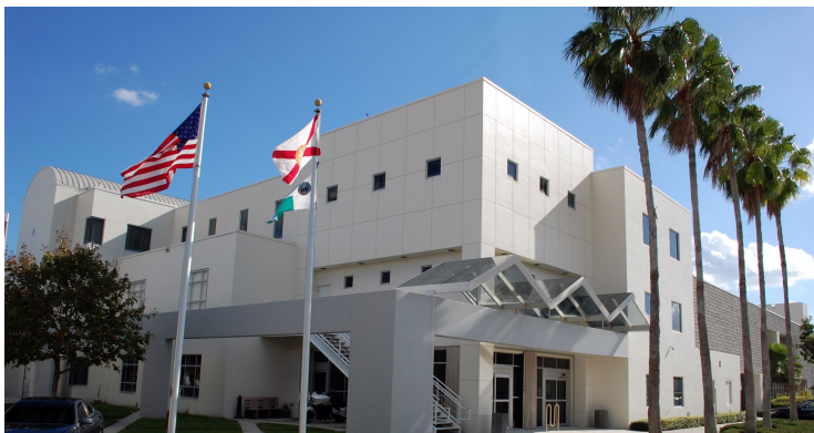
Boca Raton Traffic Engineering Division

The City of Boca Raton Municipal Services building also houses the city's Traffic Engineering Division, consisting of a suite of offices and dispatch stations. The entire 5,980 sq. ft. suite required renovation.