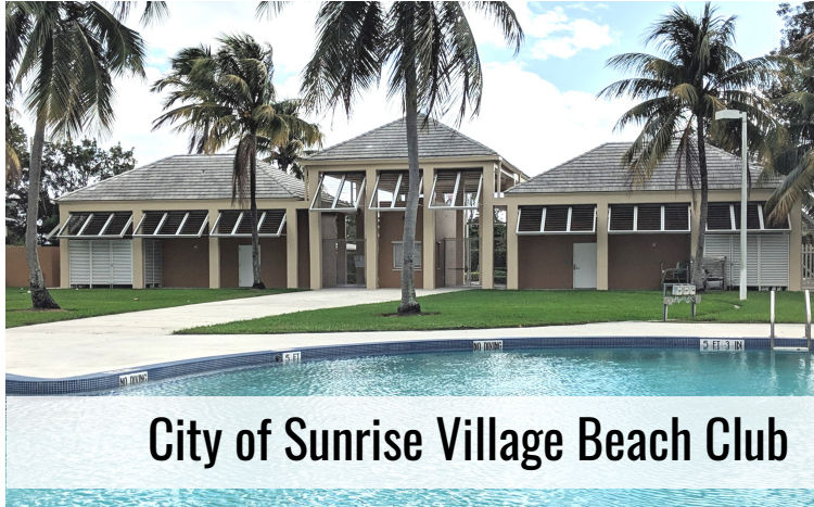
City of Sunrise Village Beach Club

The City of Sunrise Village Beach Club is a public recreational facility featuring an outdoor pool. Bildworx Design performed MEP engineering design to existing buildings within the 4,500 sq. ft. facility.