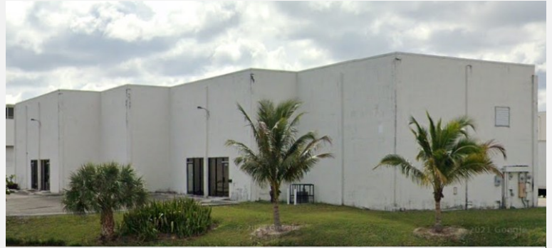
South Park Rd Warehouse