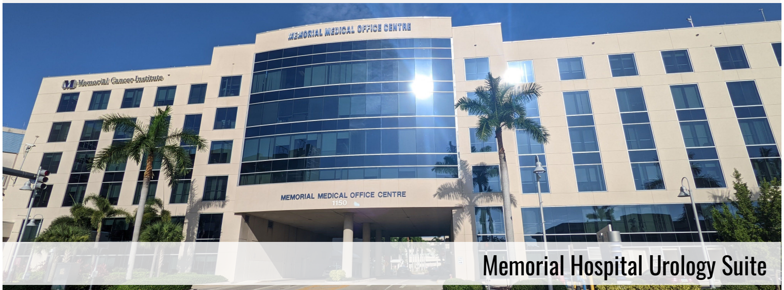
Memorial Hospital Urology Suite

For more information, visit us at www.bildworx.com