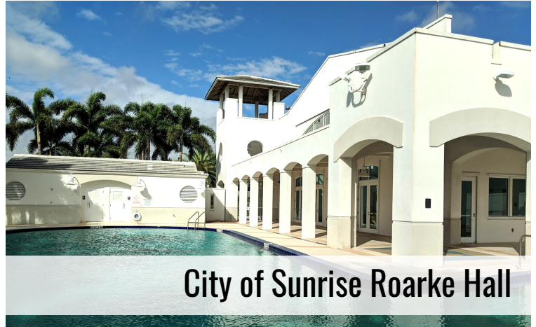
City of Sunrise Roarke Hall

The City of Sunrise Roarke Hall, the city's first recreation hall, features community spaces and an outdoor pool. Bildworx Design performed MEP engineering design for interior and exterior renovations within the 3,200 sq. ft. facility.