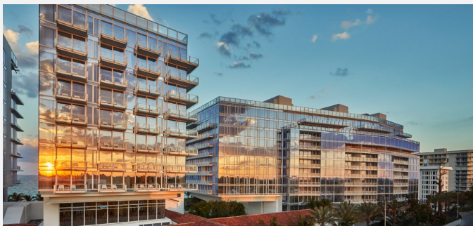
Four Seasons Surf Club - Valet Area